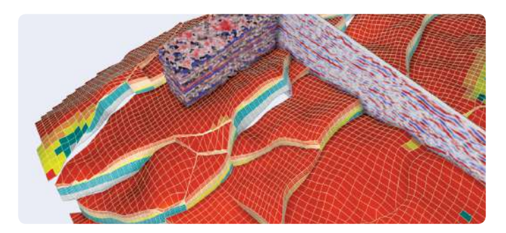
A Geologic model from Gullfaks visualized together with seismic data using Huespace.