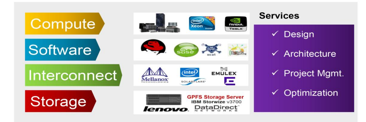
Figure 3: Lenovo Provides a Complete HPC Ecosystem

With Intelligent Cluster, clients can focus their efforts on maximizing business value, instead of consuming valuable resources to design, optimize, install and support the infrastructure required to meet business demands.